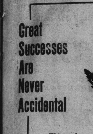
FRIDAY MORNING THE TORONTO WORLD SEPTEMBER 1 1899

First race, 1/4 mile—Lillian Mack, 126 (McCue), 11 to 30. Second race, 1/2 mile—Marianus, 135 (Trull) 5 to 2; His Lordship, 108 (Mather), 16 to 2; Tim the Tiptoe, 104 (Mather), 20 to 1.