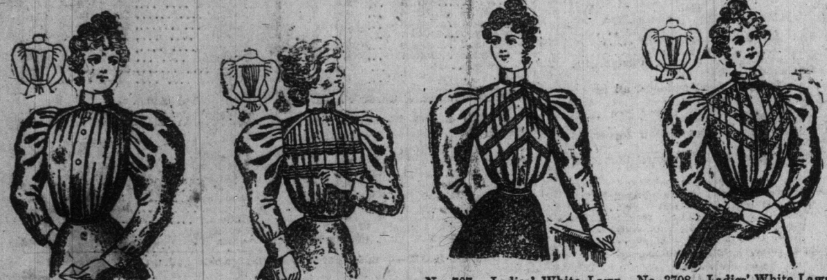
No. 789. Ladies' White Lawn Shirt Waists, white detachable linen collars, sizes 32 to 42 inches, $1.00. No. 108. Ladies' White Lawn Shirt Waists, white detachable collar, tucked front, sizes 32 to 42 inches, $1.25. No. 797. Ladies' White Lawn Shirt Waists, white detachable standing collar, front trimmed with Swiss insertion, sizes 32 to 42 inches, $1.98. No. 8708. Ladies' White Lawn Shirt Waists, white detachable collar, front trimmed with Swiss insertion, sizes 32 to 42 inches, $1.98.

SHIRT WAISTS. The newest styles and latest novelties in Ladies' Shirt Waists for summer wear will be found here. These are a few gleanings from our magnificent assortment of White Lawn Waists. You can judge the entire stock by these four items:—