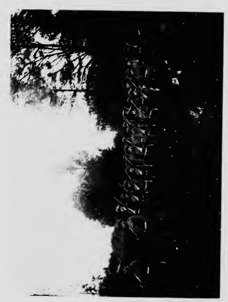
The Cadet Corps.