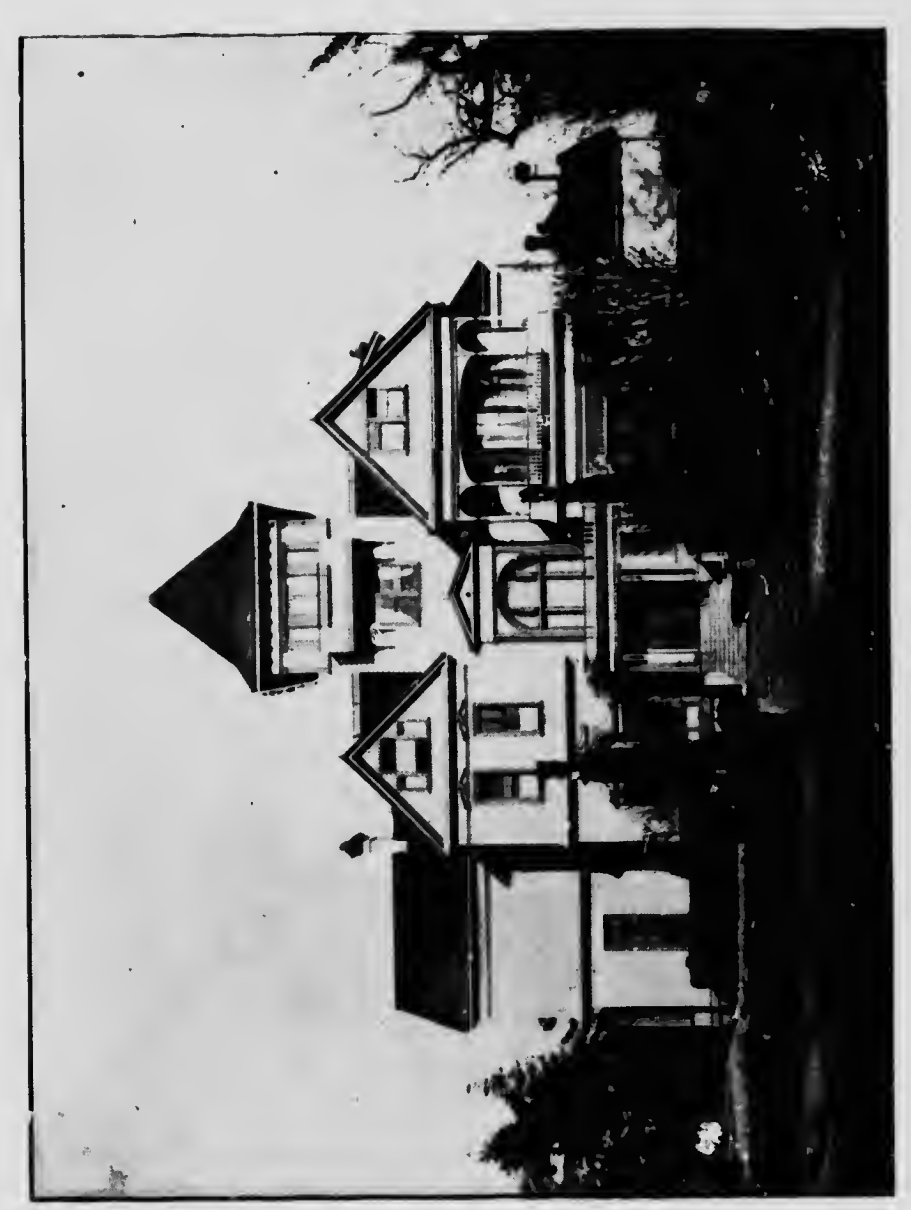
The Main Building