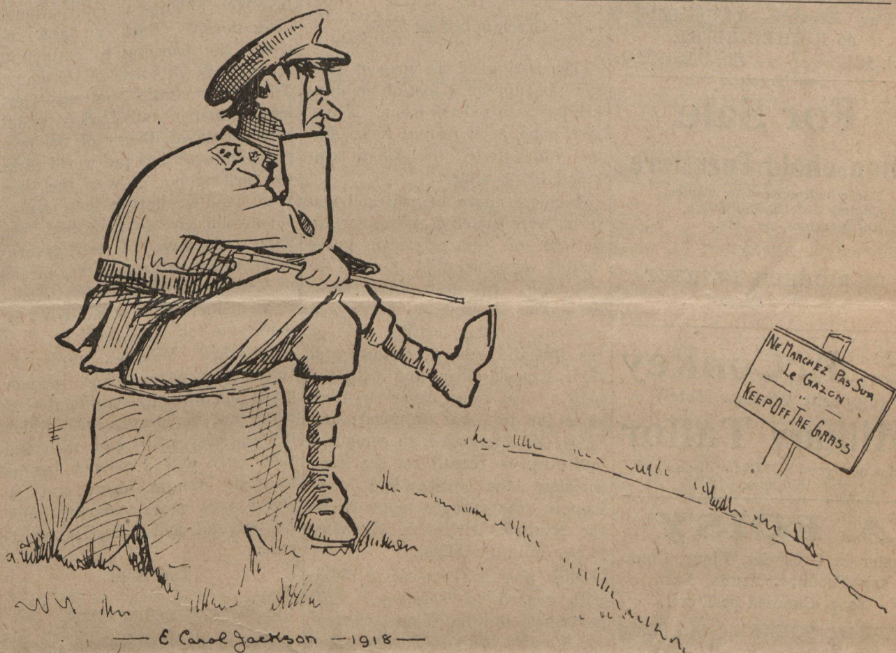
"His First French Lesson"

warfare on Germany. On April 9th the British opened up on the Lens to Arras offensive, followed a week later by the advance of the French from Soissons to Rheims and in the next week the British advanced on the Scarpe. The month of May saw both British and French in offensive, and on