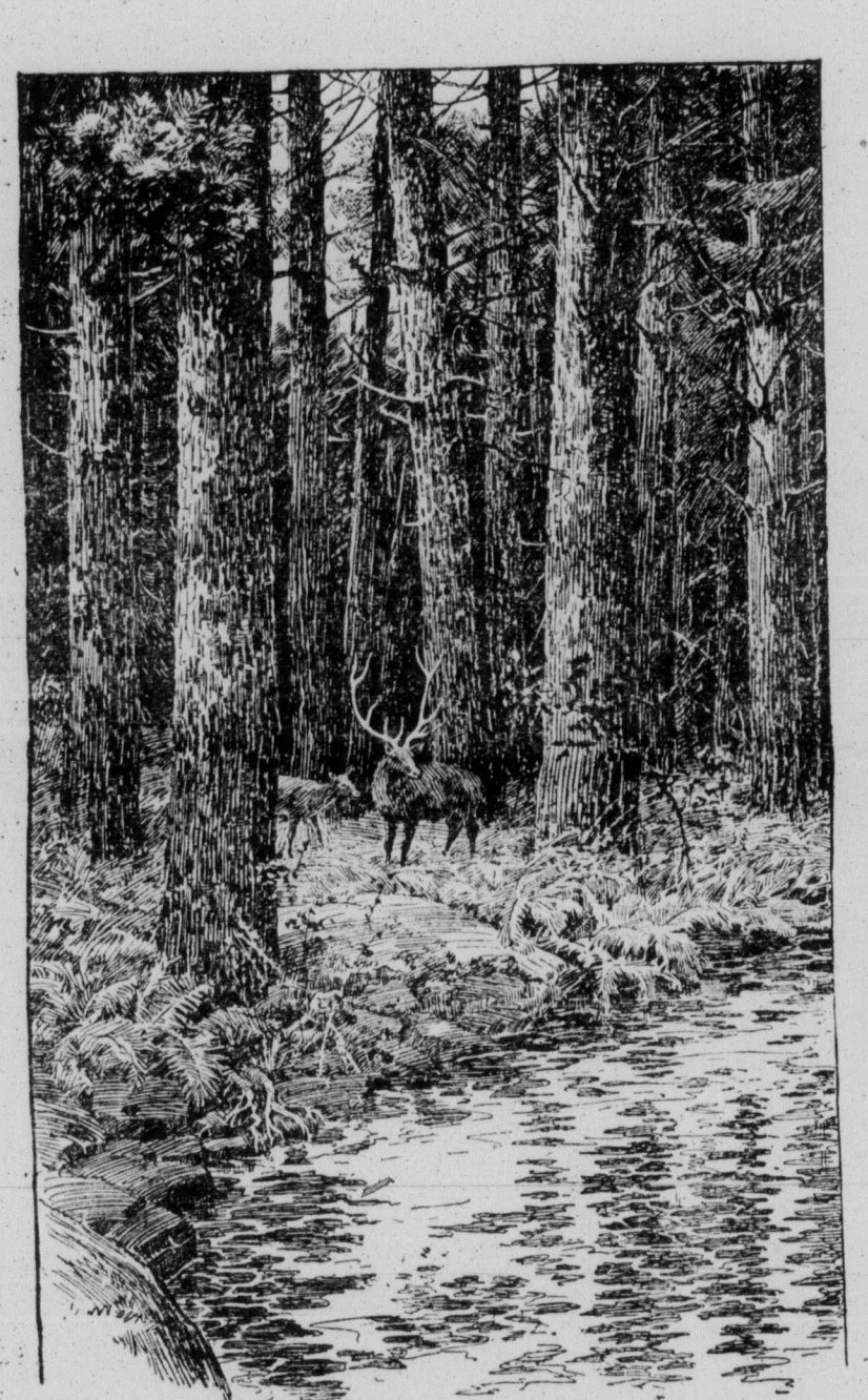
IS IT WISE TO CHANGE THIS