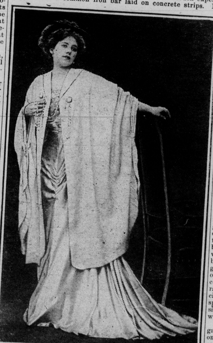
Graceful in the Extreme—A Cloak of Serpent Green

to lapse, though it is scarcely necessary to emphasize once stated and are beyond doubt. It is much safer, easier and