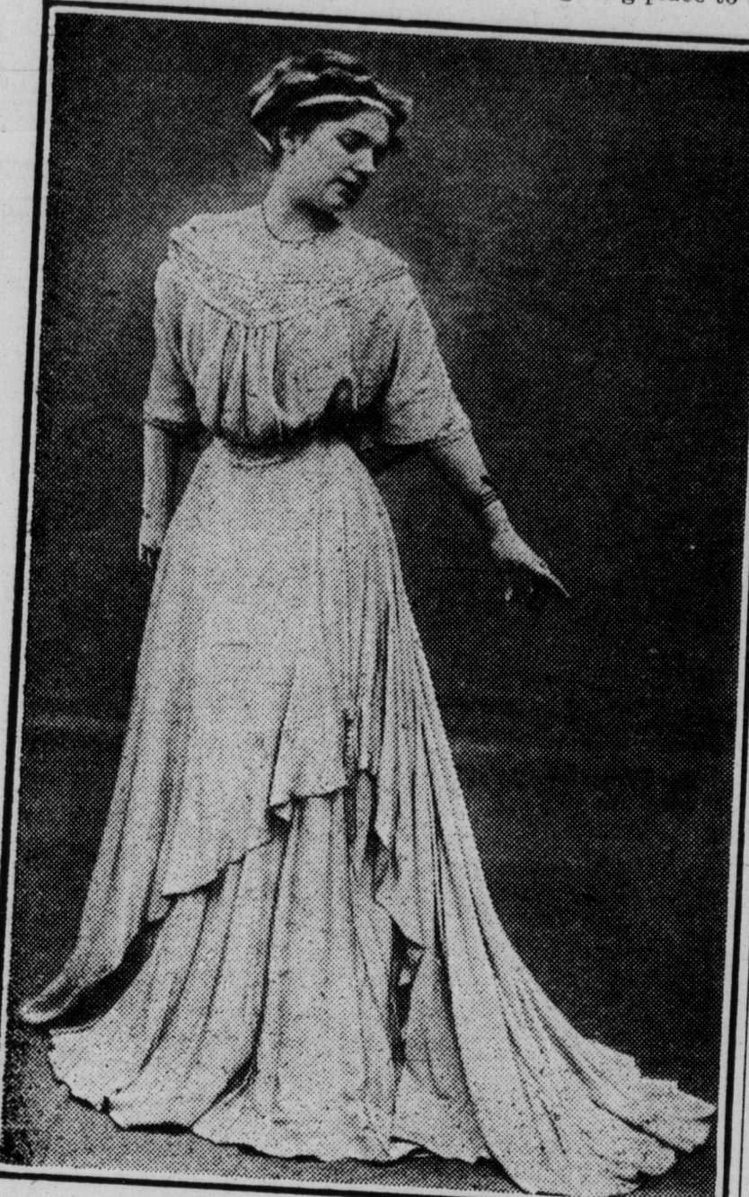
Clinging Crepe, With High Waist Line

modes that have found favor among us for a long time past.