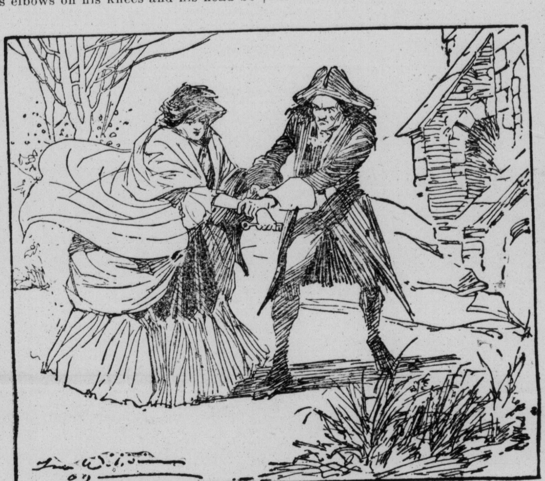
'Let It Go!' He Panted, 'Or I Shall Hurt You!'

tently. "You must sign!" Still he did not answer; he only look- worthy-overwhelmed her. ed at her with eyes of infinite reproach. to fight, because his right arm is per-