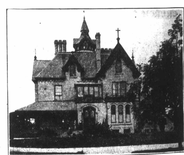
Bishop Bethune College, Oshawa, Ont.