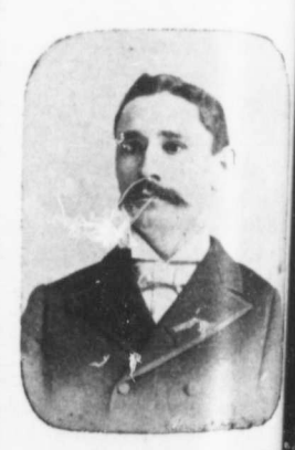
YE NAUGHTY EDITOR

Meaning thereby that I made unfair, untruthful and dishonest reports of the proceedings of the said convention.