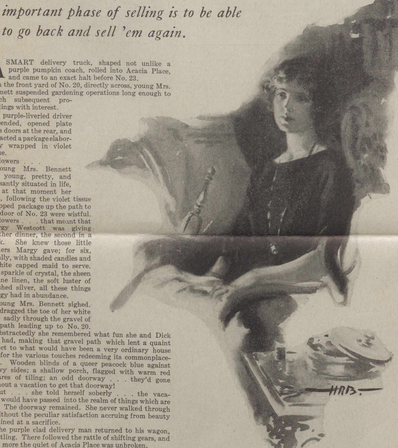
Sometimes Dolly sat cross-legged in front of the fire, dreaming of their future, if ---?

Envy . . . she reminded herself sternly . . an entirely ignoble emotion. The meanest, cheapest, most contemptible . . . her adjectives slid off into desolate