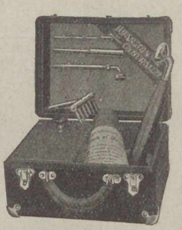
Illustration shows No. 7 model at $40.