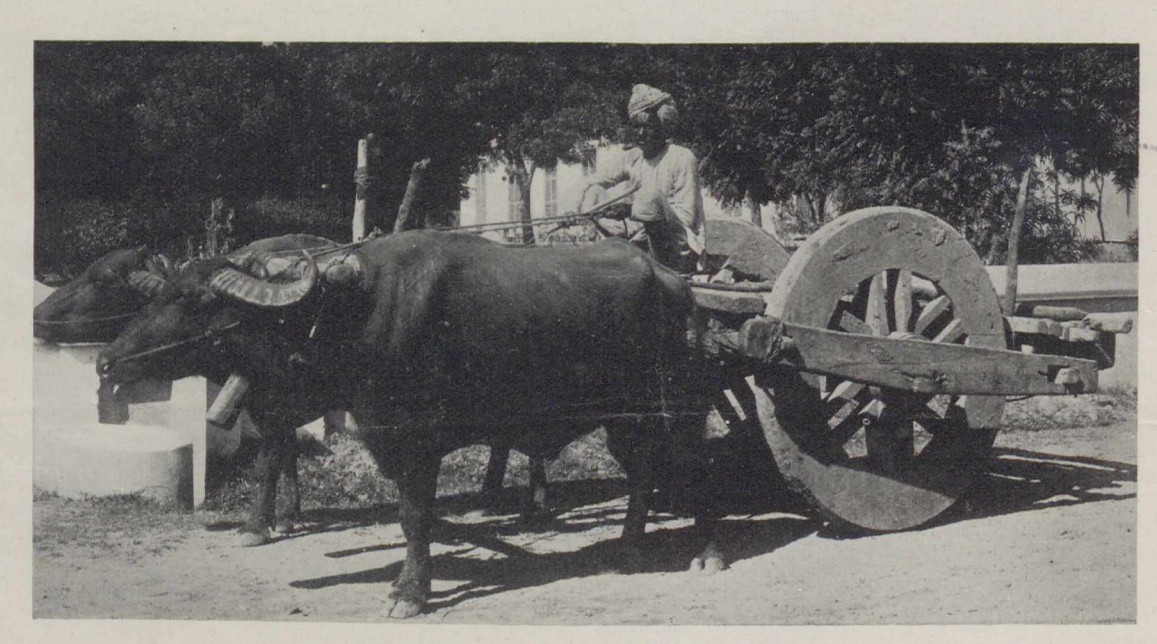
Cart drawn by water-buffaloes, Ceylon.

Wherever they are they look back with most affectionate interest to the years spent at the University and say that they hope some day to revisit it and see the old campus once again.