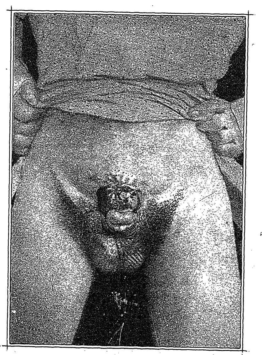
From photograph taken two days before first operation.