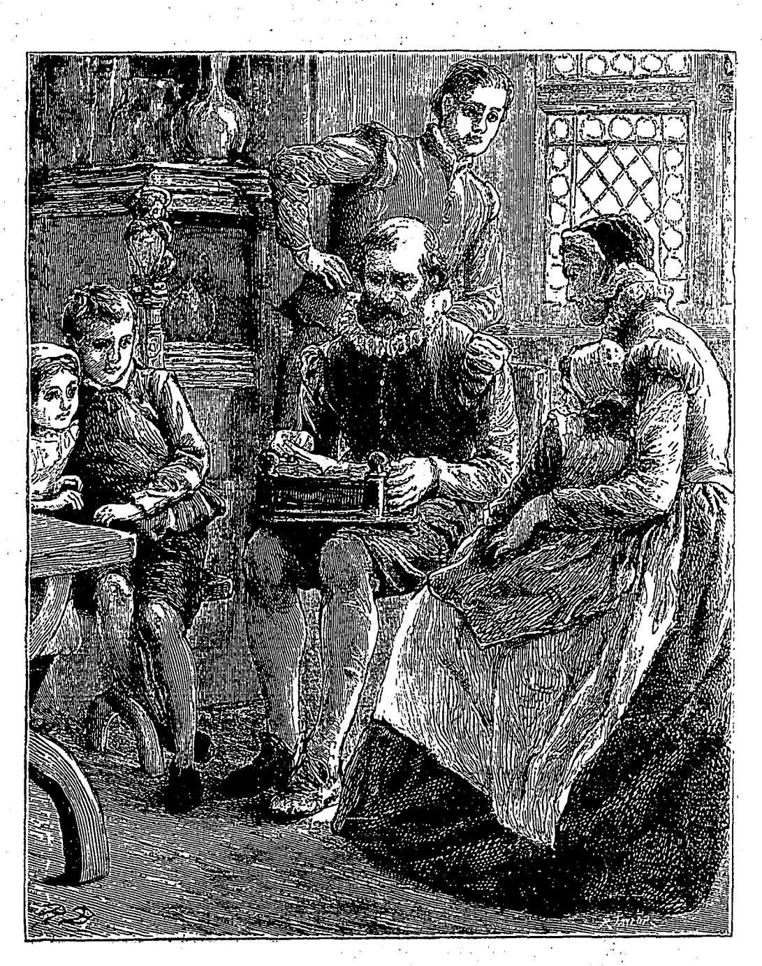
SOMETIMES THE FATHER WOULD TAKE THE STOOL UPON HIS KNEES.

ONE who claims to have counted, says there are in the Bible 3,536,483 letters, 773, words, 31,373 verses, and 1,189 chapters.