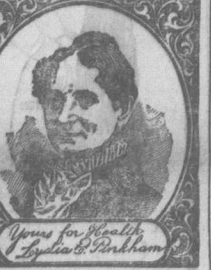
Lydia E. Pinkham

This remarkable woman, whose maiden name was Eaton, was born in Lynn, Mass., February 10, 1819, coming from a good old Quaker family.