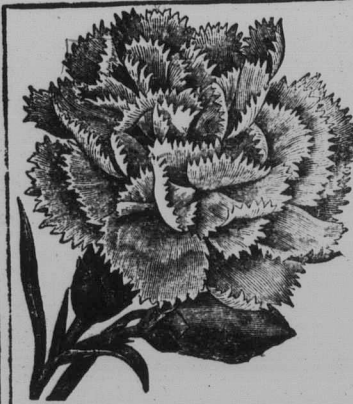
Giant Flowering Carnation