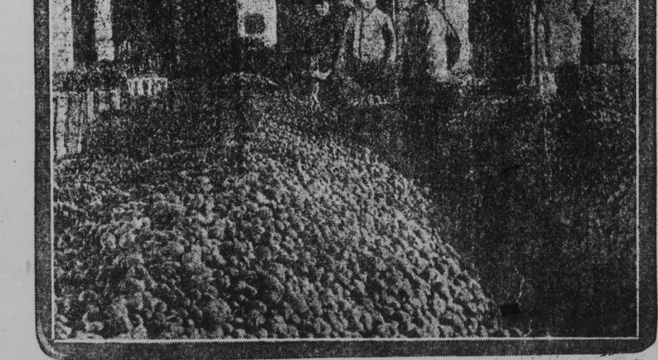
A Potato Day for the Belgian People.

the air. In older weather only more there is very little to choose between the results are not rapid. As a result of the treatment skin of boots. When it comes to solid comfort there