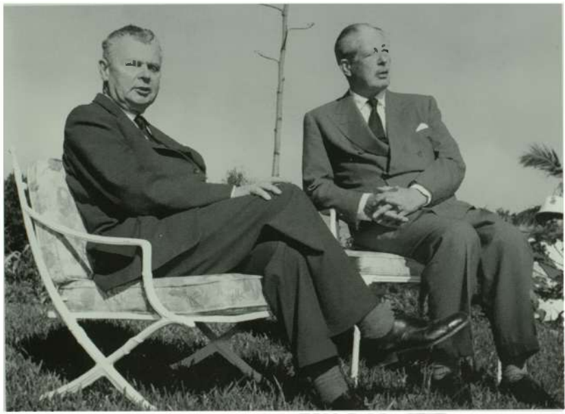
Diefenbaker Canada Centre, JGD 1453