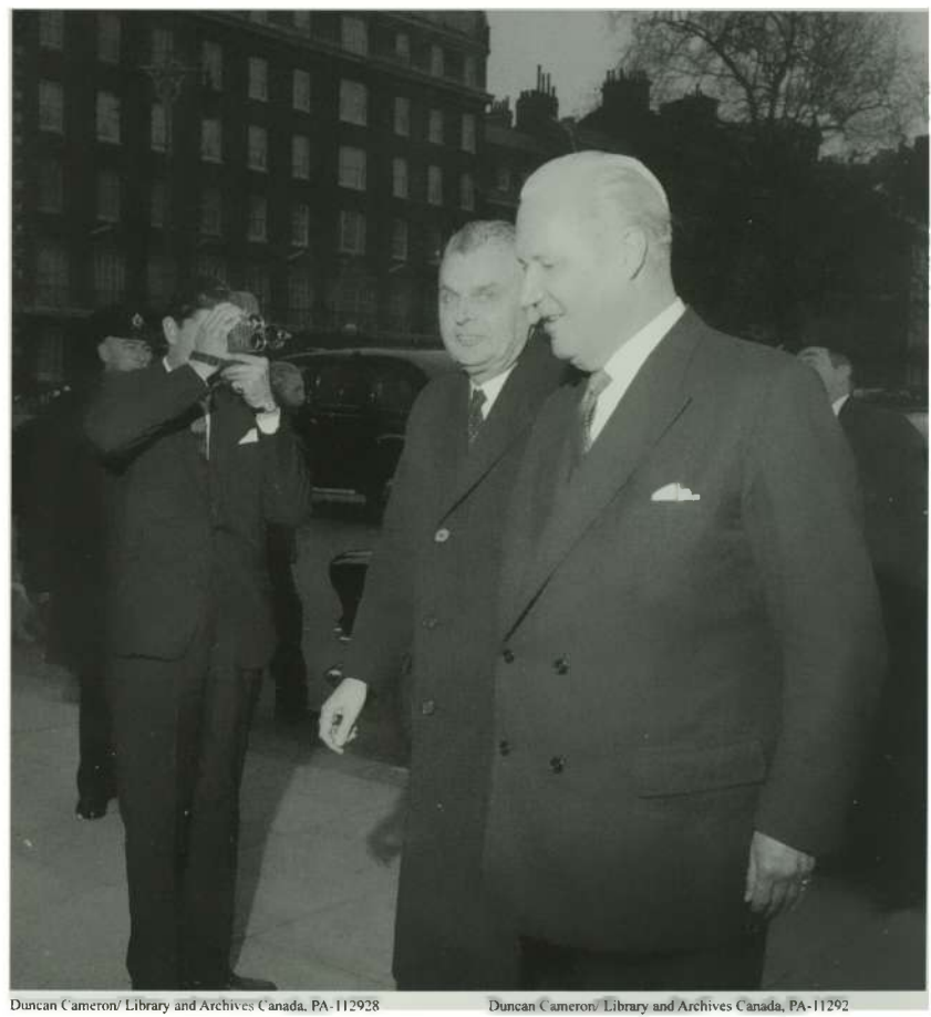
Duncan Cameron/ Library and Archives Canada, PA-112928