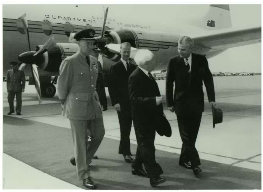
Diefenbaker Canada Centre, JGD 1385