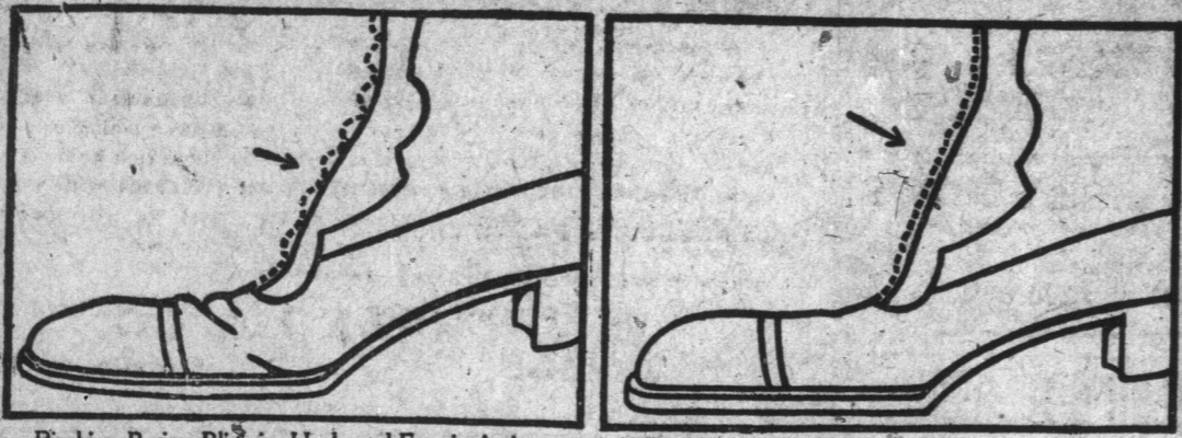
Pinching, Boring, Blistering Hooks and Eyes in Action. Foot-rite "Won't Blister" Hooks and Eyes in Action.

Everybody knows that most hooks and eyes blister. Everybody's leg, ankle and instep surface bears scars and calluses which grate of hook and eye blisters that are there. But why do hooks and eyes blister?