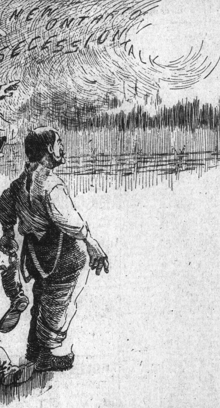
OLD MAN ONTARIO: Do you seem to notice a flare-up over there in the direction of the wood lot, James?