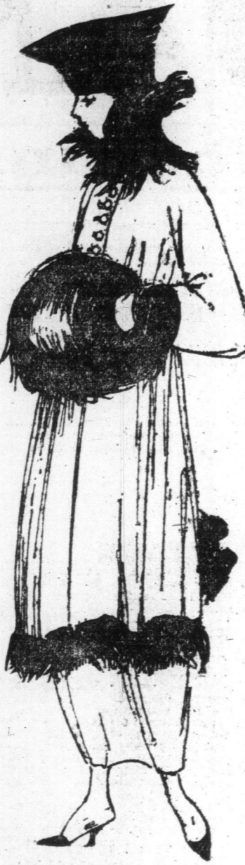
RICH AND LOVELY.

Reg. $250, $275, $285, $300, $325, $350 & $375 $199