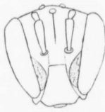
FIG. 8. P. stevensi , female.— Face.

more closely punctured. See figures 6 and 7 for structure of seventh and eighth ventral plates.