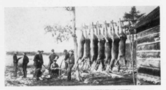
LAST DAY IN CAMP, MAGANETAWAN RIVER