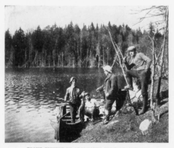
TROUT FISHING IN ALGONQUIN PARK OF ONTARIO

The situation of the park and contiguous territory might be called the eastern section of the "Highlands of Ontario," and covers an area of 2,000,000 acres of forest and water stretches, there being no less than 1,200 lakes and rivers within its boundaries. This vast extent of virgin wilderness has aptly been named "Lakeland," and the Ottawa Division of the Grand Trunk Railway System penetrates its confines for many miles, giving exceptional facilities for reaching the different points of ingress to the many canoe routes and navigable lakes and streams which radiate from the railway line north and south, making the region easy of access from any point of the American continent. Unlike many of the other lake districts in Ontario, the waterways throughout the whole area of the Park are a continuity of lake and stream, many of them being navigable for canoes from one to the other, while others are