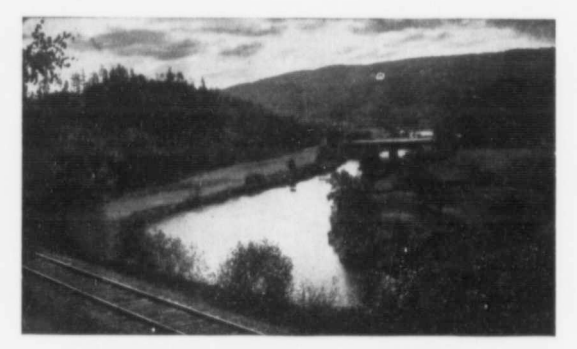
WINOOSKI RIVER, NEAR MIDDLESEX, VT.

Portland and Casco Bay form the Utopia of those with moderate means; nowhere will a dollar procure more of seaside pleasures. Hotels in city and on the islands in the bay are numerous, and an unlimited number of boarding houses and cottages are in evidence and to suit all classes.