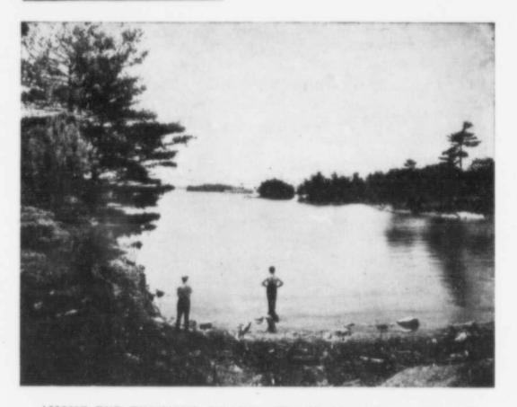
AMONG THE THOUSAND ISLANDS OF THE ST. LAWRENCE RIVER

localities are the haunts of sportsmen, especially those who enjoy fishing and wild foul shooting, and every facility for these pursuits, as well as for boating and other watering-place recreations, is furnished by the summer hotels among the islands.