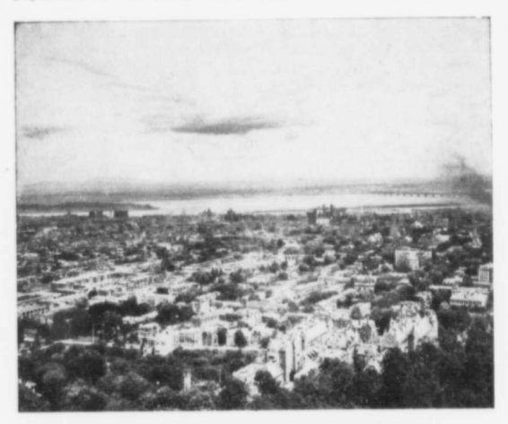
CITY OF MONTREAL, FROM MOUNT ROYAL

a village of Indians situated near the foot of the mountain. He landed a short distance below the city, at a point still known by the Indian name of "Hochelaga." When he reached the top of the mountain, to which he was guided by the Indian Chief, "Donnacona," he was so struck by the magnificent outlook, that he named it in honor of his master, the "Royal Mount." Champlain also visited the site in 1611, but the village with its inhabitants had been swept away, probably by some hostile tribe. The first settlement by Europeans was made by the French in 1642. In its early history the city was repeatedly attacked by the Indians, and in 1684 a wooden wall was erected for defense. This was replaced in 1759, when Canada was conquered by the British, Montreal had a population of 4,000 souls. The streets were narrow and the houses