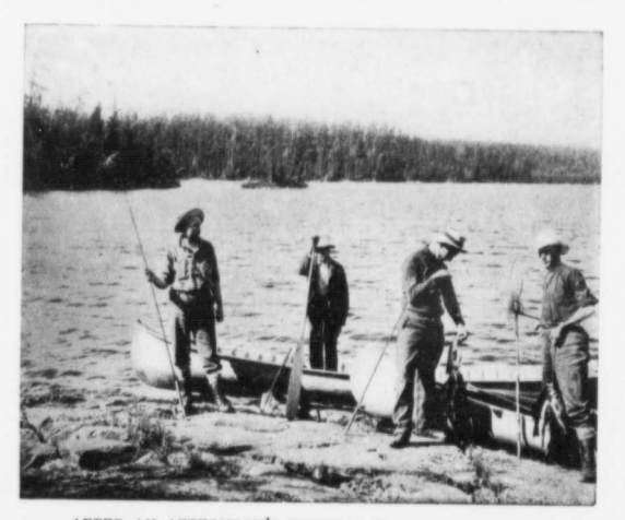
AFTER AN AFTERNOON'S FISHING, TEMAGAMI DISTRICT

Another of the most delightful and beautiful trips that may be taken in Canada, and not surpassed in any other country, is through