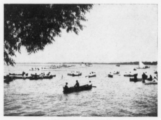
LAKE COUCHICHING, ORILLIA

Orillia is at the gateway of the Muskoka region, for it is at this point that the landscape characteristic of that district makes its appearance. The town is built on the hillside, overlooking lakes Simcoe and Couchiching. The ground rises from the water's edge in a series of terraces, gradual slopes leading from one to the other, until from the topmost there is a splendid outlook for forty miles over Lake Simcoe. A handsomely illustrated booklet, giving fuller description of this lovely spot, may be had on application to any of the representatives mentioned in this booklet. (See page 31.)