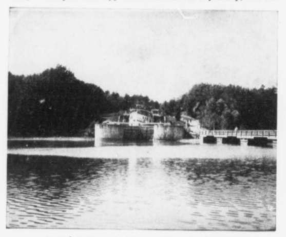
JONES' LOCK, ON RIDEAU LAKE AND RIVER TRIP

We now pass into Big Rideau, the queen of the chain, it being twenty-one miles long, and from one to eight miles in width and having over 200 islands. Until now we have never estimated lakes highly. A river that came from somewhere and was going somewhere, hustling along as if it had a train to catch, or a bill to meet, or had just been appointed chairman of a primary, was dis-