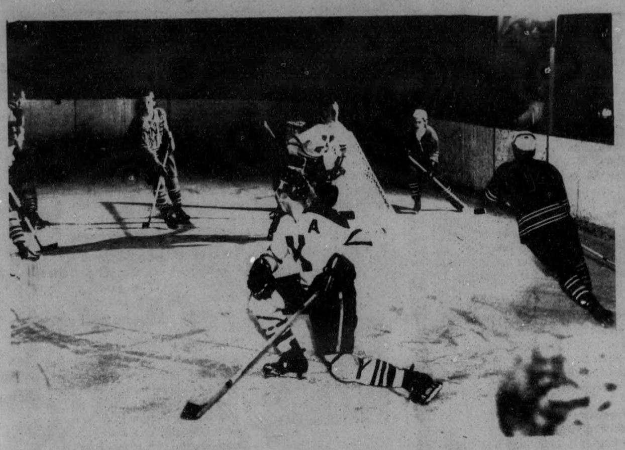
LeBlanc, Winslow and Stairs look for loose puck.