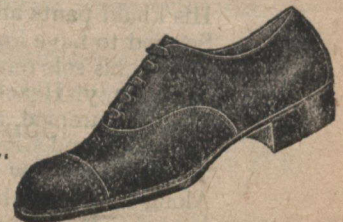
The "Burlington" Reg.

is over the Store where you buy your FOOTWEAR it guarantees the quality and ensures satisfaction