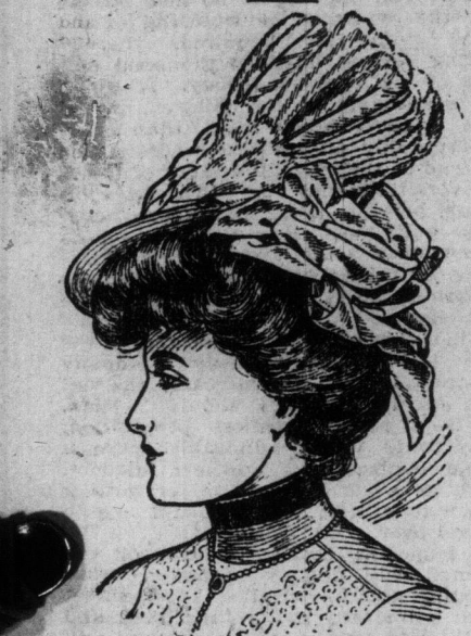
T. EATON COMPANY.

At Eaton's The World's attention was called to the Merry Widow and the Merry Widow sailor hats. This Merry Widow was soon heard of elseacross, and the crown is trimmed to give a high effect. Here Copenhagen blue is found to be the leading color. This is the taking shade for both hats and suits, combined with greens and