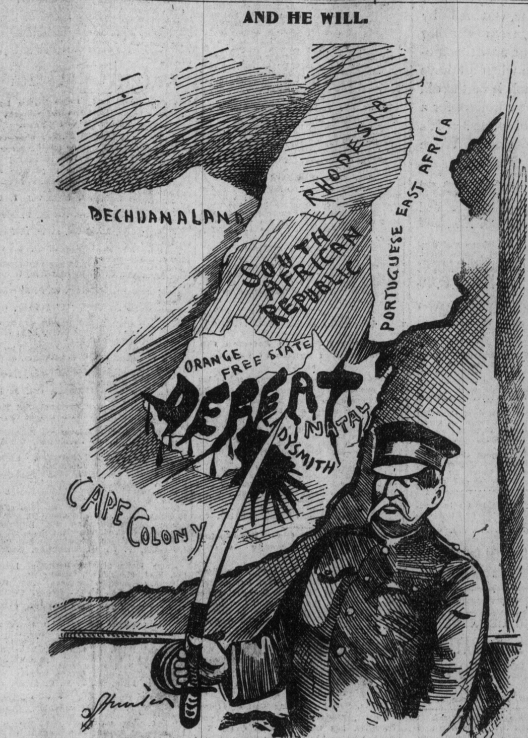
GENERAL BULLER: It's a blot on the map—it's a blot on the name of Britain; but, fellow Britons, I shall cut it out.