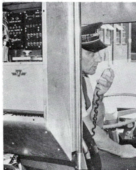
Driver demonstrates communications fitted to special bus.

Its advantages will be to eliminate the need for inspectors controlling