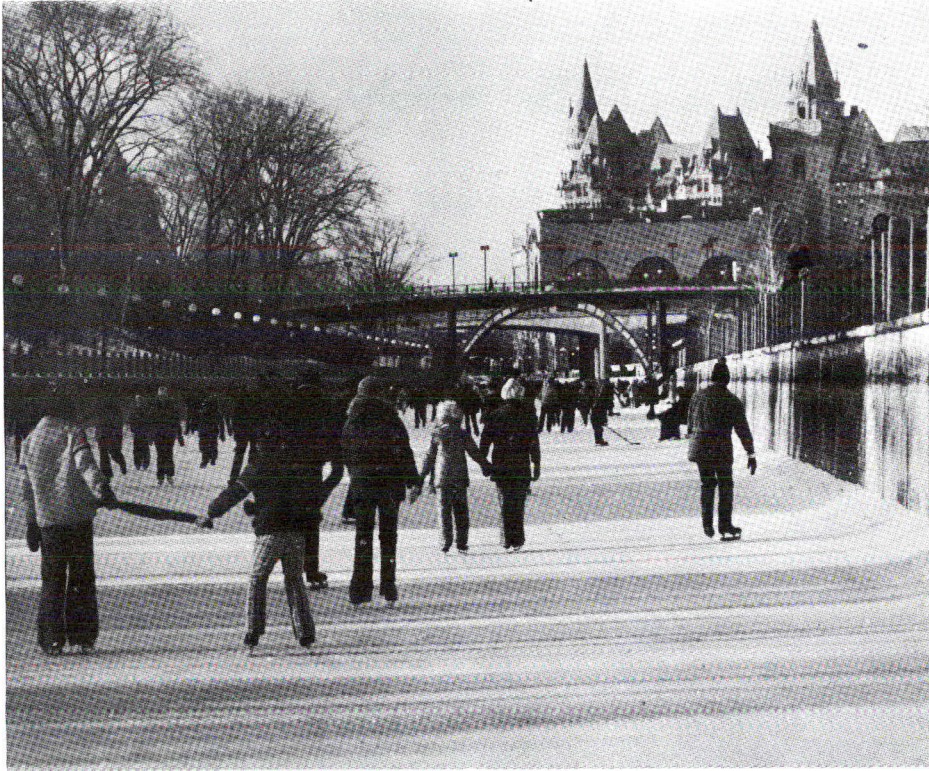
Ottawa's Rideau Canal, claimed as the longest skating rink in the world. Some 5½ miles of skating surface is

maintained by the National Capital Commission, which also provides a skate patrol and "warm-up" huts.