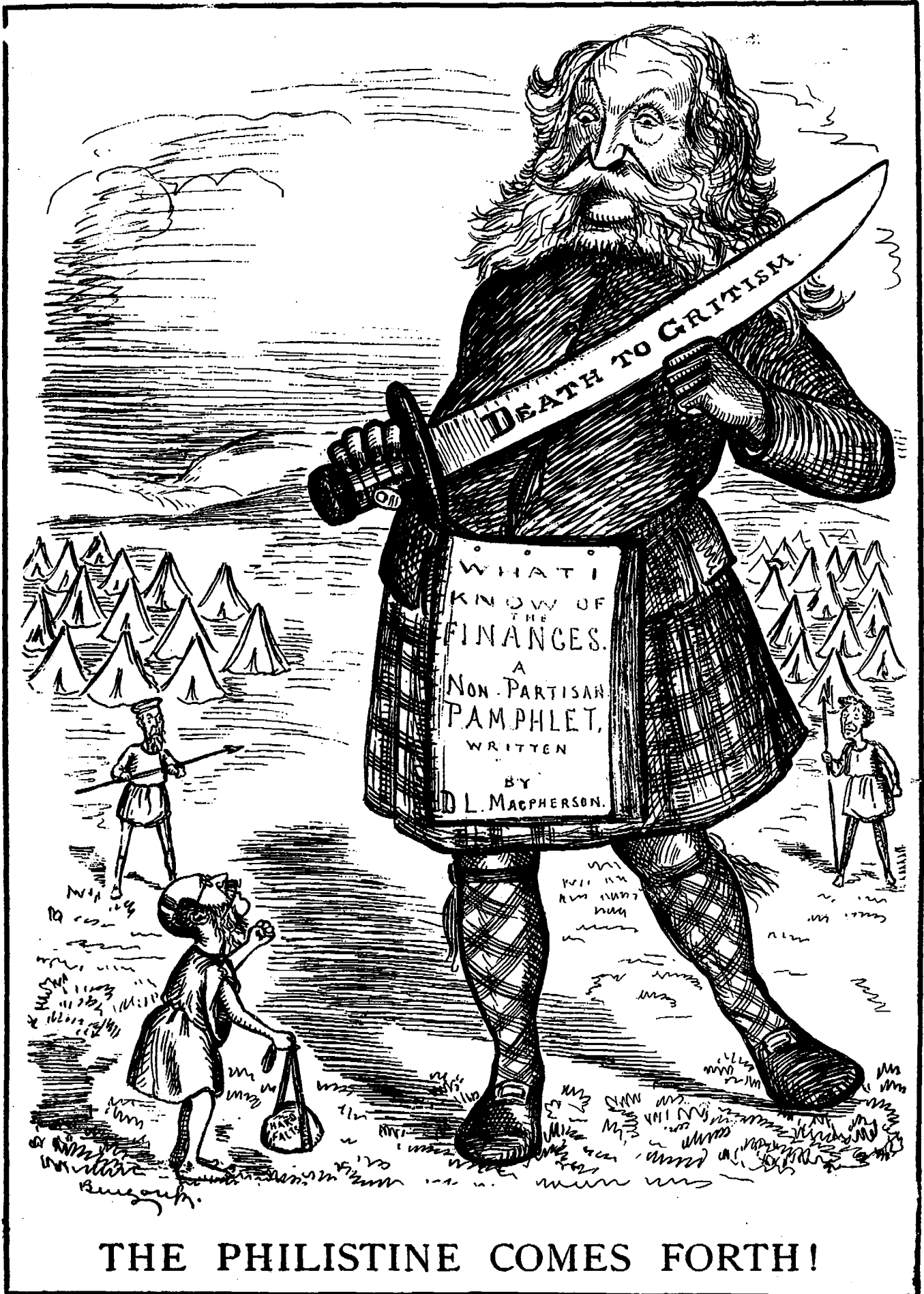
THE PHILISTINE COMES FORTH!