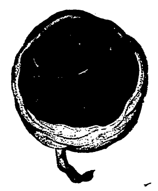
· Fig. 2.—Placenta from Fig. 1 after delivery, showing on the maternal surface the saucer-shaped cavity occupied by the clot.

obstetrical operations when performed before the onset of labor. There is no doubt, however, that the procedure is an excellent one in its proper place, but its scope as compared with that of the introduction of the vaginal plug is much more restricted. In the case of concealed accidental hemorrhage before the enset of labor, and especially before the effacement of the cervical canal, it is, I think, never justifiable. In the case of the combined internal and external accidental hemorrhage before labor, one cannot speak so positively, but it seems probable that in such cases the operation is unjustifiable. If, however, labor has commenced and the external hemorrhage is serious, the rupture of the membranes will frequently, or perhaps generally, produce a good result by diminishing or frequently stopping the flooding. The puncture of the membranes may produce good results even if done before the onset of labor if there is