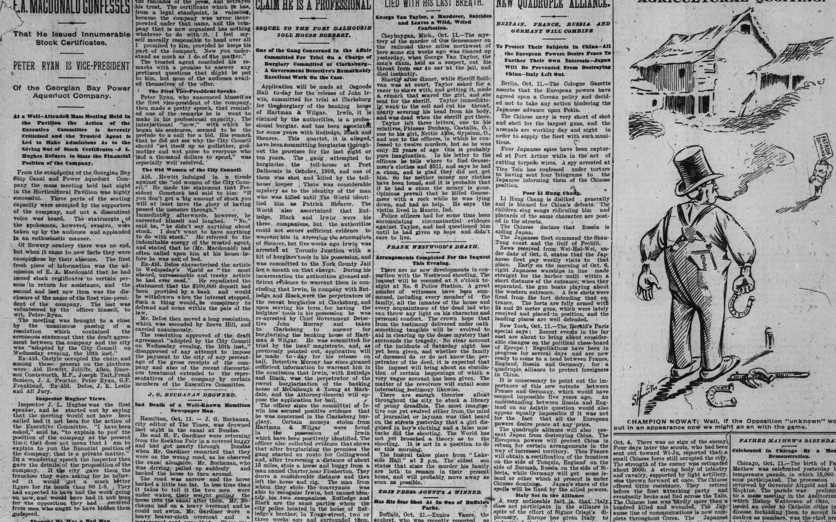
CHAMPION MOWAT: Well, if the Opposition "unknown" would

district of Hiroshimi under article 14 of