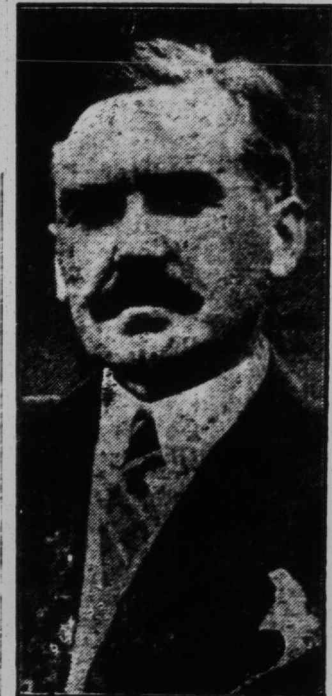
Finance Minister of Canada

prepriation made at the special war session. Taking all expenditures into consideration, the increase of Canada's debt for the present year would