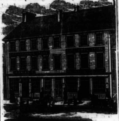
FALL SUPPLIES BEGINNING TO ARRIVE AT THE

PINE TIMBER, in Lots to suit purchasers.