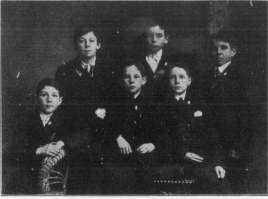
BRIGHT BELLEVILLE BOYS