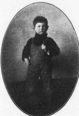
"YOURS FOR SERVICE IN CHINA."

I sometimes ask is it the boy problem after all, or is it rather the leader prob-lem? The Young Men's Christian Association says the latter. Has it answered rightly? A principal of one of Toronto's Boys' Industrial Schools, who has had to crack some "hard nuts" in his time, to crack some nard must him in a star declared a few weeks ago that he nad never seen a "bad" boy. He certainly ought to know. But is he wrong or right? It is a question of definition. If "bad" means the specific violation of criminal and moral law by a single act, then he is wrong. But if it means, as I suspect it does in the mind of the principal, a continuously and deliberately perverse attitude toward the good —if it be a condition and not simply an act—then it may be that the principal is right. Certainly most boys have in them the "potential" good, and it is up to someone, and we may call that some one "leader," to learn the law of the