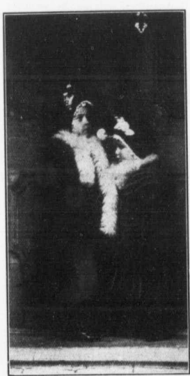
"WHY DON'T THEY LET US IN?"

We have taken the privilege while visiting a number of the Sunday School and League Conventions in the West, of making some tests as to the early religious experience of the workers present. Here is a result of three of these tests, the others reveal similar proportions. Out of a total of one hundred and eight workers, eighteen, or one-sixth of the total number, have no recollection of conversion; taat is, they do not remember the day when they did not love God and realize, more or less definitely, that Jesus was their Saviour. Thirty-six, or one-third of the number