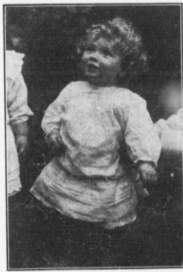
SEE THAT PRETTY BUTTERFLY."

Boy of Quinte Conference at Welling ton, July 4 to 11. Wr te Rev. R. Whattam, Woodville, for programme.