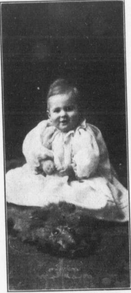
A CHINESE PARSONAGE BABY.

any school. And yet, if the week-day school can be kept up five days out of every week, summer and winter (excepting holidays), it has occurred to me that even in country districts the Sunday School roight be kept up all the year without much diffi-