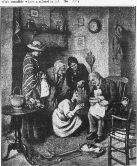
OUR HEART'S DELIGHT.

The Sunday School and the Home should be intimately and affectionately In the earliest springtime of life, the Cradle Roll, and in the later autumn-tide, the Home Department give entrance to the homes of the community. The school that neglects either of these important departments is remiss in its