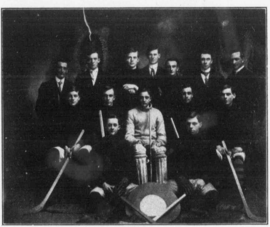
THE BEREAN CLASS HOCKEY CLUB.

away; Change and decay in all around I see, O, thou who changest not, abide with me!