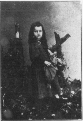
A DAUGHTER OF THE PARSONAGE.

In my opinion a good deal of the literature provided for the very young in our libraries is very washy stuff. As a rule, too, little attention is paid to this section of the library. The books seem to be chosen chiefly for their large print and bright pictures. My wife, who has been reading for our children the books brought home by tuen from the infant class library, declares that the Sunday School should supply handkerchiefs with the books if gives out, for before she gets through the story in hand the carrul little faces are looking up into hers as their owners follow the tragedy of the story. Even