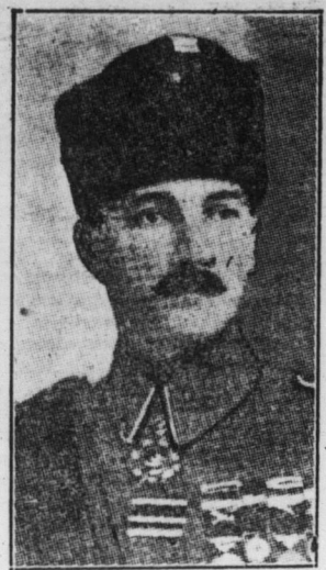
Mustafa Kemal Pasha, Leader of the Turkish Nationalists, who have so decisively defeated the Greeks in Asia Minor. He is commanding the best equipped Turkish army that ever conducted a campaign. He demands that the Allies hand Constantinople over to the Turks.