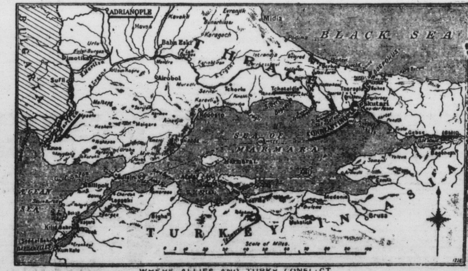
WHERE ALLIES AND TURKS CONFLICT. Britain is taking a firm stand against the Turks under Kemal Pasha, whose demands since his victory over the Greeks have been notable for their comprehensiveness. The surrender of Thrace by the Greeks, the abandonment of any designs to hold Thessalonica, and the withdrawal of Allied forces from the neutral zone around the Dardanelles, Constantinople and the Bosphorus are all parts of his requests. Bulgaria is reported as mobilizing along the Maritza River, and also to be demanding the surrender of Adrianople. The British Government is hopeful that France and Italy will assist in felling these propositions. If they fail, Britain will oppose the Turks alone. The places mentioned in the foregoing will be found on the map underlined. Other points which may figure in dispatches later will also be found on the map.

According to preliminary estimates the production of gold during August from the mines of Northern Ontario was the highest on record, with a total yield of approximately $1,840,000. For the first time the production of gold in Ontario exceeded the rate of $220,000,000 a year. Eight mines contributed to the output, three being in Kirkland Lake. At least five more producers will likely be included within a few months, while the present producers, by enlarging their mills, are expected to add close to 50 per cent. to their output within the next twelve months.