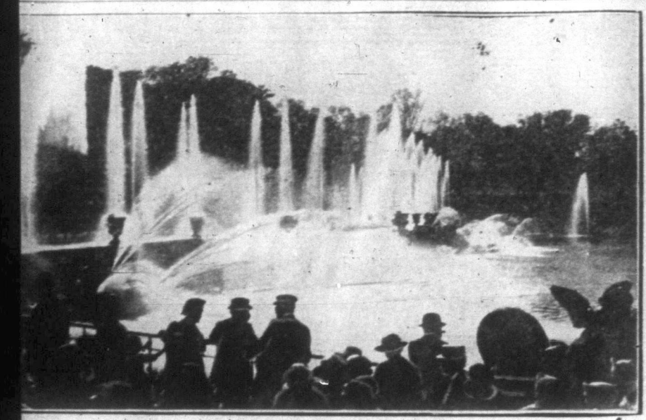
The fountains at Versailles, recently playing for the first time since the war.