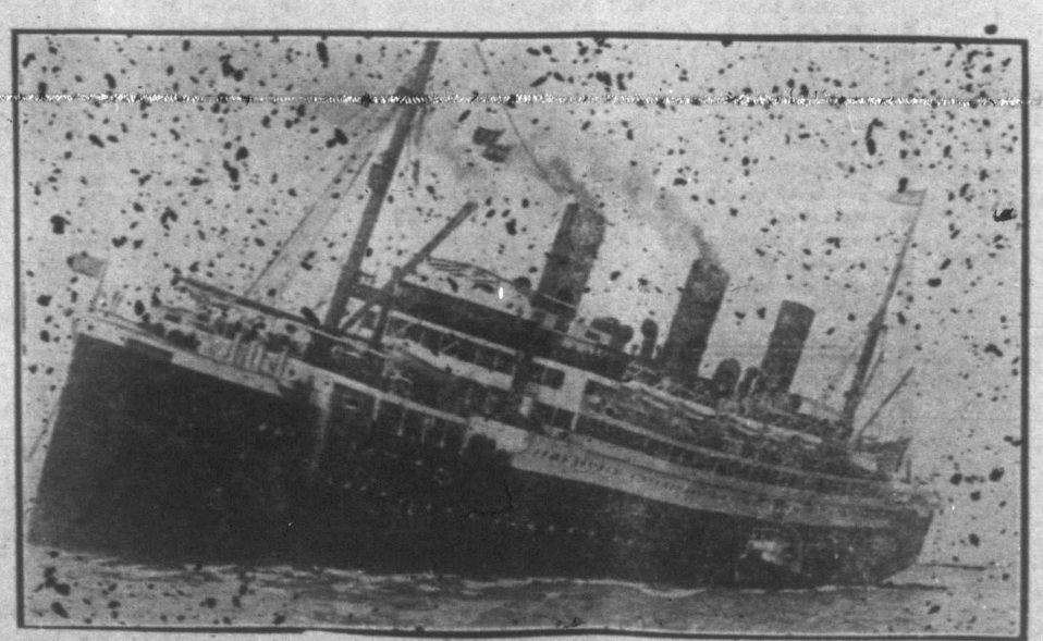
Atilt in New York harbor, S. S. "Resolute" looks dissy, because of oil being pumped into reserve tanks.