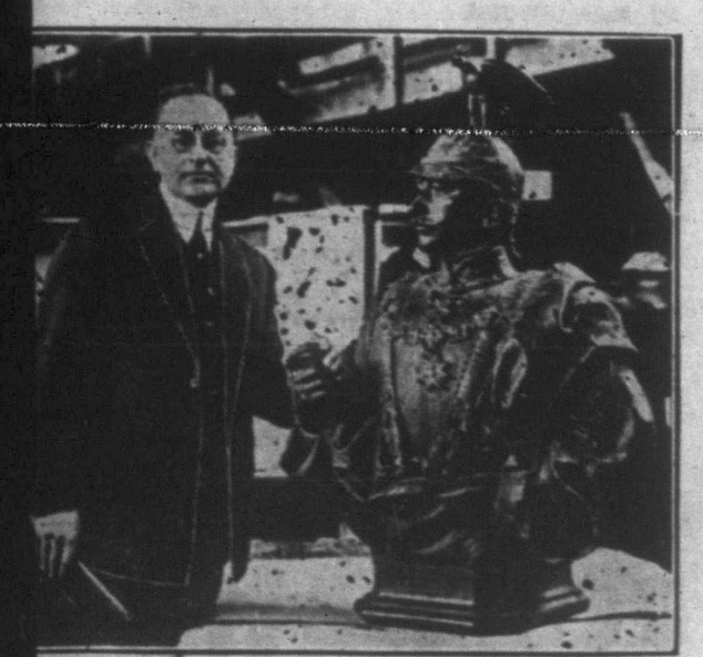
his bust of the ex-Kaiser, taken from the imperial cabin of the Vaterad, was sold by auction the other day in Connecticut. The first bid was 30 cents—the last $835.