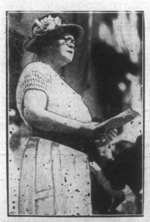
Mrs. O. H. P. Belmont dedicating the new headquar fors of the American Women's National party. She