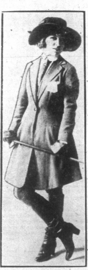
Mile. Dorys, French actress an film producer. She's only twenty.