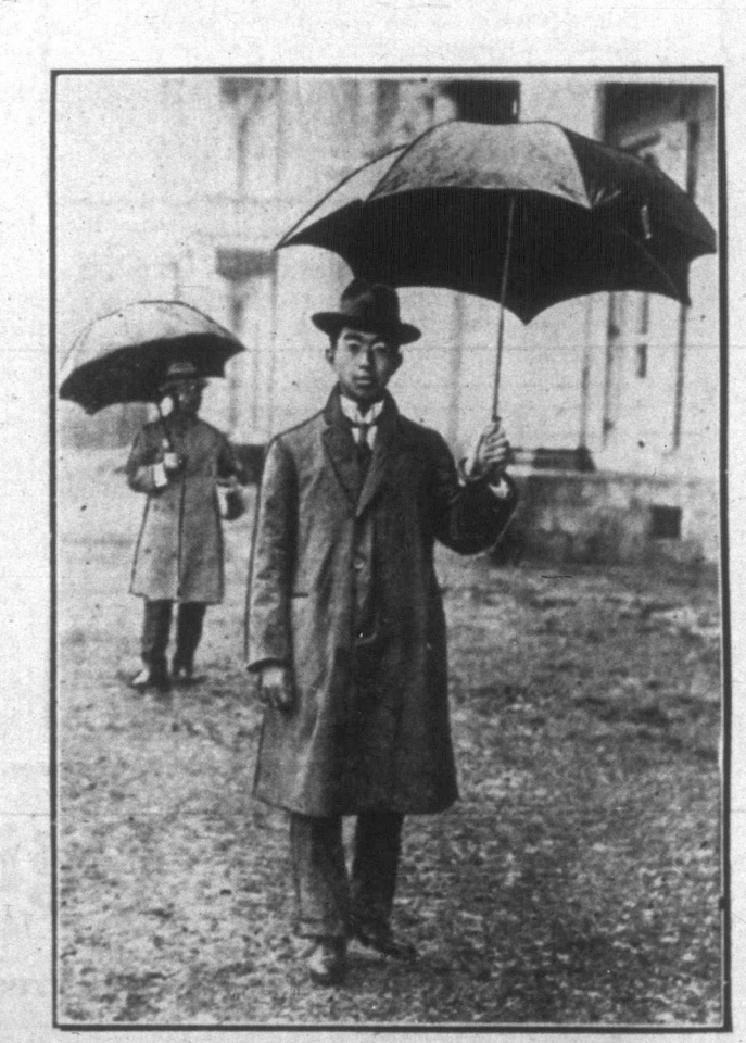
squith walks in the rain without an umbrella, but the Crown Prince of Japan uses one. His bodygnard follows him.