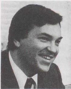
André Ouellet, PC Papineau (Québec)