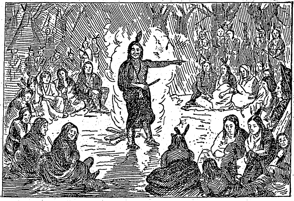
AN INDIAN POTLATCH.

'The Canadian Government has very wisely prohibited these festivals, as they are the cause of retarding the progress of the