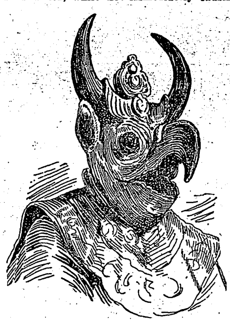
INDIAN CONJURER'S MASK.

sons so deadly that a little put in the food of a person who has excited their displeasure, will cause death almost as soon as a dose of strychnine. They have other poisons which, while not immediately causing