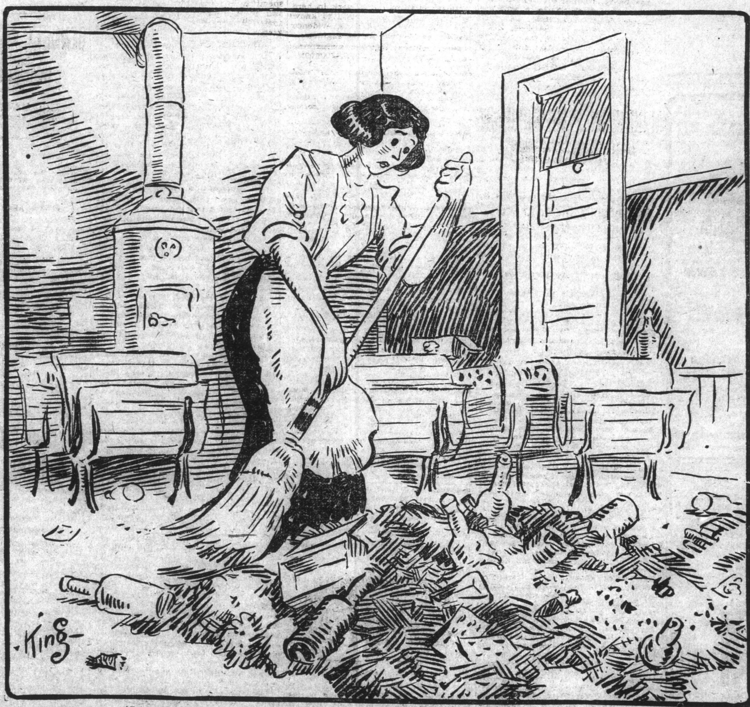
"It's goin' to be hard on th' school ma'am sweepin' up th' cigar ashes"