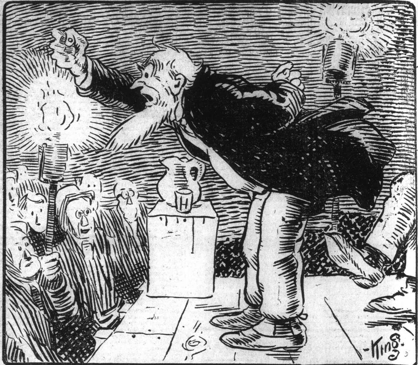
"We all turned out to see our leaders waggin' their chin whiskers about th' tariff."

"He rings th' bell an' says to th' office boy: Jimmy, get yer autymobil an' run down to th' refinery an' see if they can fill this order. On yer way out ask Mr. Huggins to step this way!... 'Mister Huggins, th' plant we installed at Wash'ton seems to be runnin' badly. I wisht ye wud hop down there an' see what's th' matter with it."