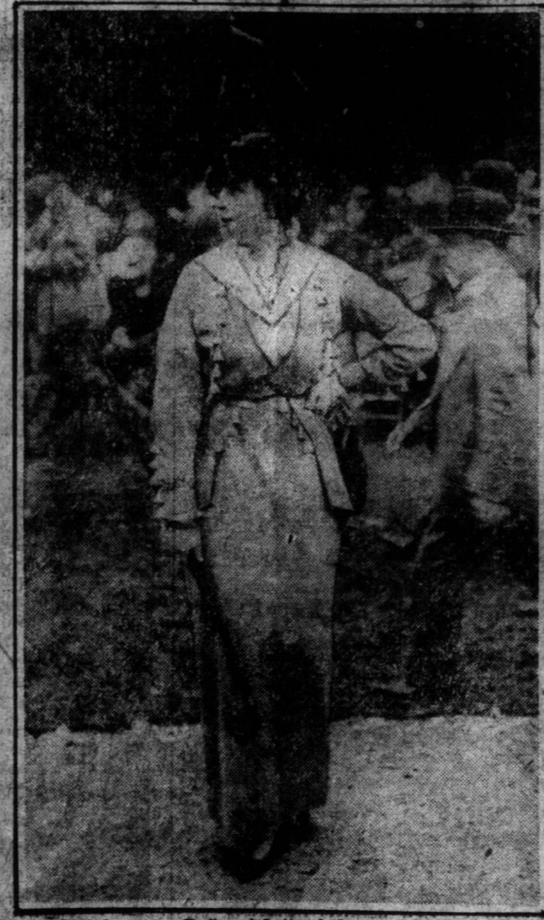
A Midsummer Tailored Suit of Gray and White Checked Woolen Material. Copyright, N. Y. H.

has a very simple yet artistic decoration and is topped off with the charming array of a fulness to the dress hem such as has not most marvellous wrap. Made of white moiré, it is lined with a wonderful silk tulle was the fashion and gowns were fastened with numerous buttons down the front near waist line that shortens the corsage in stripes. It is bordered on the outside in the gown of white lingerie. It is heavily of the crown and a wide cape shaped collar edge by a piping cord and on the inside trimmed with Cluny lace, and is caught up at the knees of quaint lines. A large brocaded velvet