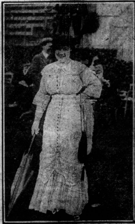
Reminiscent of the Days of the Feteoise, When Dresses Buttoned Down the Front.