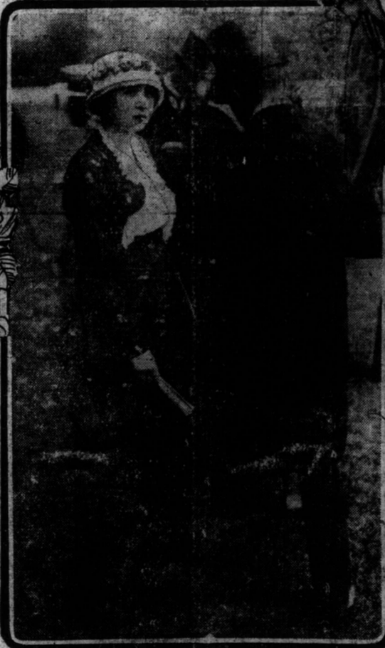
An Extremely Modern Silhouette Gowned in Flowered Taffeta.

away bow posed in front. One of the new sun and rain parasols is carried and a silk handbag mounted in chased silver is heavily trimmed with box-pleated ribbon. Worn over a filmy white tulle robe that