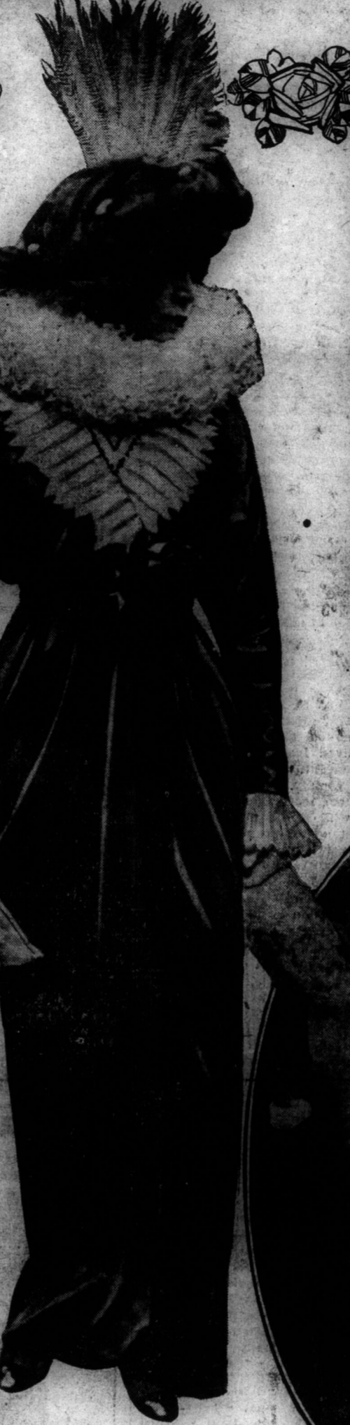
Of Reddish Purple Châtrouse, with Pleated Frills of White Lace.