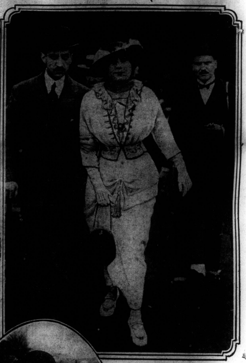
White Taffeta Casque Coat with Robe of Mousseline de Soie.