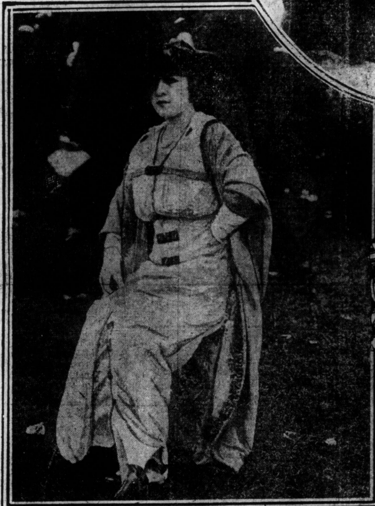
The Rose Moire Wrap is Lined with Flowered Silk and Has an Ermine Collar.

edge, gives the new width across the center of the figure and is fastened down the front by tiny round buttons. All lines combine, from the long, loose sleeves to the unfitted skirt, to give the new loose look that gowns are acquiring because of the utter lack of seams and gores. The tiny hat helps to accent this, too, with its little overhanging lace brim ruffle and skippy flower wreath.