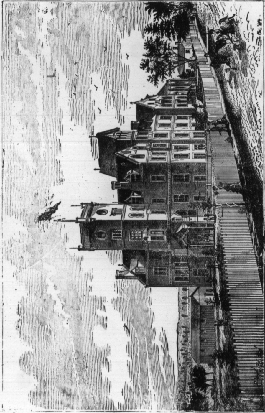
TRINITY COLLEGE SCHOOL, PORT HOPE.