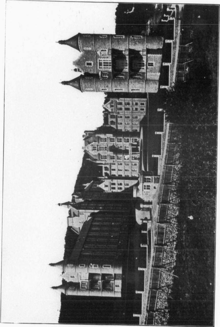
ROYAL VICTORIA HOSPITAL.