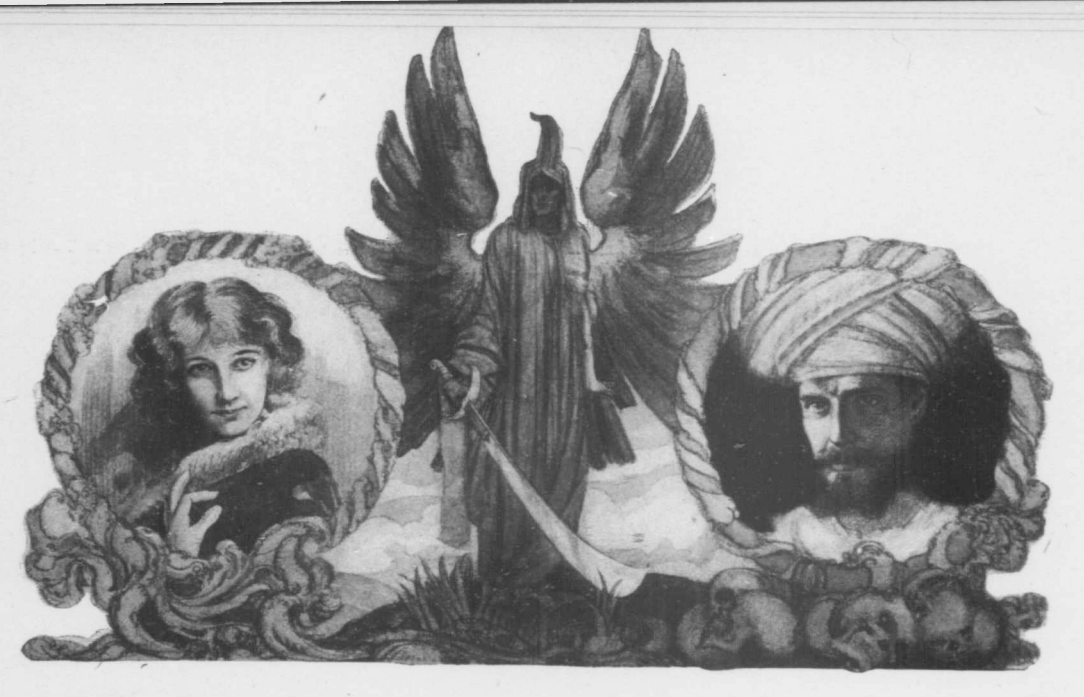
"Oh, East is East and West is West, and never the twain shall meet, Till Earth and Sky stand presently at God's great Judgment Seat; But there is neither East nor West, Border, nor Breed, nor Birth, When two strong men stand face to face, tho' they come from the ends of the earth!"—Kipling.