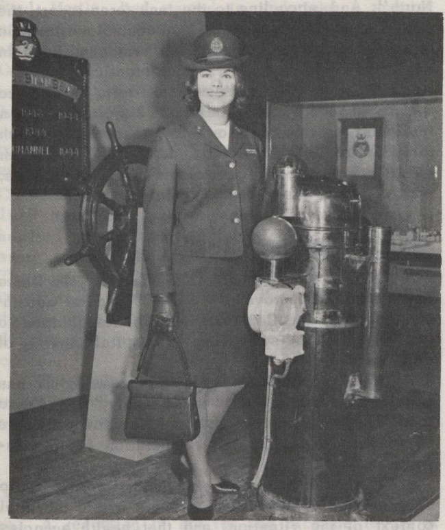
The new green uniform for women of the Canadian Armed Forces. Shown above is the dress of a lieutenant in the navy.