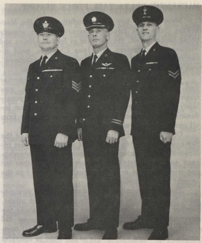
Left to right: an air force sergeant, an army captain and a leading seaman wearing the new uniform of the Canadian Armed Forces.

Some 20,000 Canadian servicemen have received their new green uniform since outfitting began last summer. Conversion from the old-style uniform should be completed early in 1972.