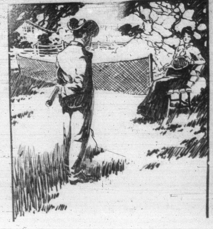
'IS SYEWELL COMING TO PLAY?" WHERE IS HE? ...

In yesterday's puzzle the slave hoy may be found by using-the upper part of the picture as base. He is then in the upper part of the picture, formed in the speaker's skirt.