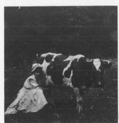
IN THE GOOD OLD SUMMERTIME.

"God intends the conscience to be a monitor." "Conscience must be educated to the right to be a good guide." Why did Paul deem himself unworthy to be called a disciple? Compare Acts 23: 1; Heb. 9: 14; and Heb. 10: 22. Is there a good conscience, a guide? Is there an evil conscience to lead us astray? Conscience—bearing witness. Rom. 2: 15; 9: 1; 2 Cor. 1: 12. For conscience as a second conscience. 1 Cor. 8: 10, 12. A good conscience. 1 Tim. 1: 5, 19; Heb. 13: 18. These and