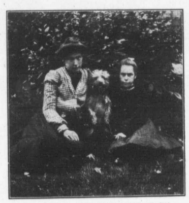
WHEN SHALL WE THREE MEET AGAIN?

"The ideals and processes of training in the past were all negative; the ideals and processes of the new training are all positive. The old training said 'don't,' the new training says 'never give up. The old training says 'never give up. The old training said be still,' the new training said be still,' the new training said 'be still,' the new training said said be still,' the new training said said the past and those of the present who are still in the negative stage, were and are honest, but they are dwarfed, and still dwarf the characters of the children because of negative ideals. A negative character must, in the nature of things, character must, in the nature of things, be a weak character. Strength in some material things may mean the power to resist; strength in the human soul means