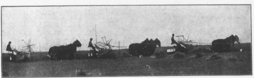
THE PRIDE OF WESTERN CANADA.

To Recognize a Limit to Sociability. So many Christians make the grievous mistake of not recognizing a limit to mistage of not recognizing a limit to social life. They refuse to hear the warning voice of God which says: "Thus far shalt thou go and no farther." social life. How many have been lost by fearing to refuse the demands of society! Others again would not go beyond the limit if they knew where the line was drawn. Let me ask you, "What is the effect of that social engagement on your Christian