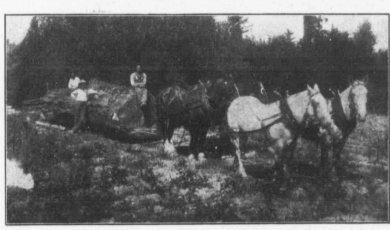
3. A FALLEN GIANT OF THE B.C. FOREST.

kindness wherewith He has saved His people from the grip of their distresses, and has gathered them, when exiled, from the four quarters of the earth: it closes (verse 43) with a hint to the "wise" that if they will but look with the psalmist's eyes upon the experiences or men they too will see the same tokens of the loving-kindness of God. But the great bulk of the psalm lying between the opening call and the closing advice falls into two parts which are so unlike one another in structural form that they might very easily be treated as separate to divisions (verses 4:32) is composed of four strophes or stanzas each of which sets forth some distinct aspect of the general theme of God's redeeming goodness, but all of which also manifestly bear the same structural form. The