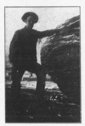
4. THE END OF THE LOG.

"If we live in the Spirit," says St. Paul, "let us walk in the Spirit." Being led by that Spirit, we shall walk in no forbidden path, but into ways of pleasantness and paths of peace shall our watchful guide bring us. "Praying in the spirit," shall cause that the place of prayer shall become the "mount of vis-