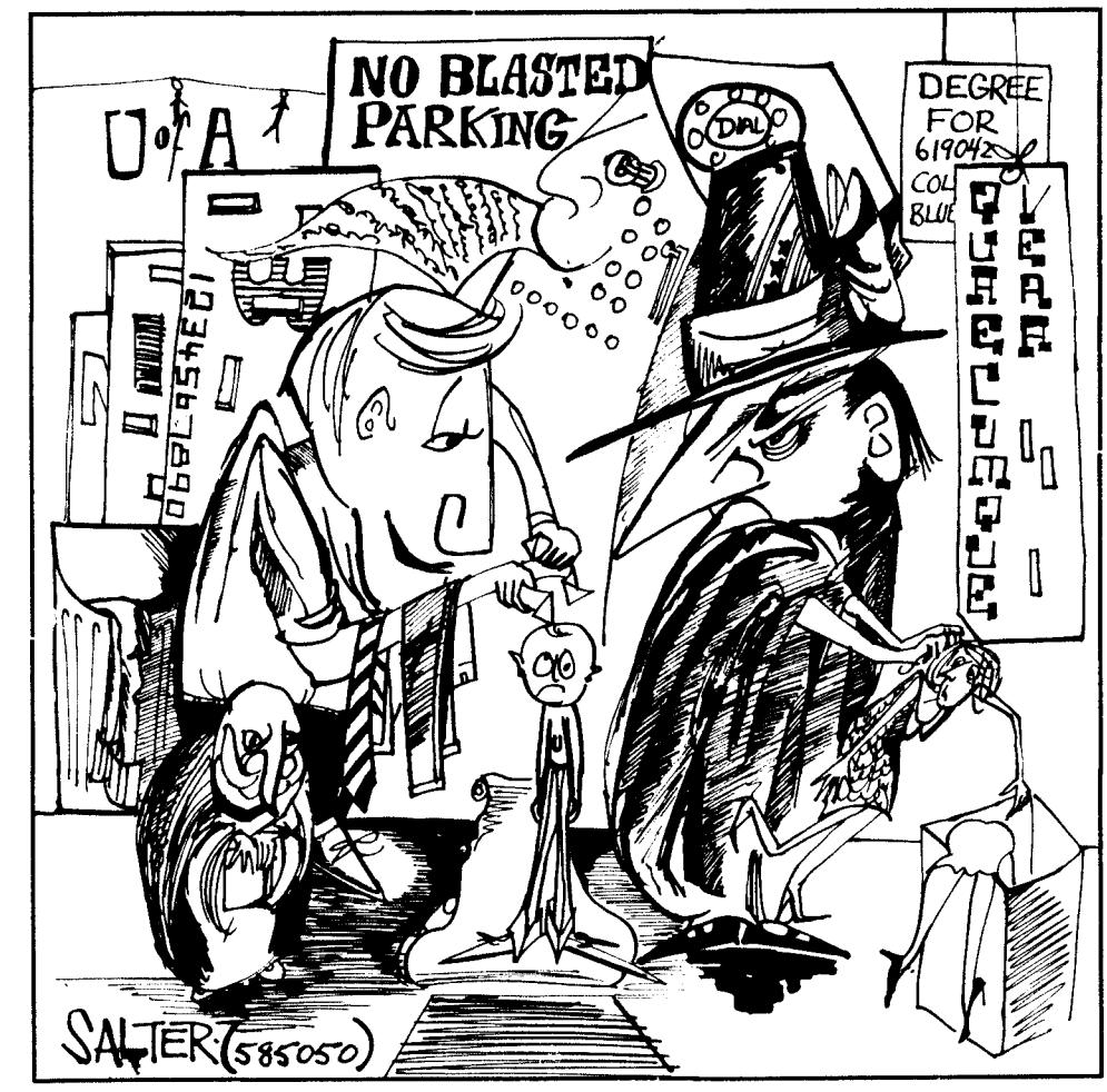
"WE'LL SHAPE YOU UP YET, SON"

The three point system as set out by Dr. Johns appear to meet these demands as closely as they can presently be met. Implementation of the proposed program cannot come too soon.