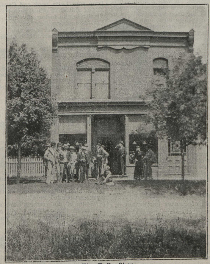
The Taffy Shop.

candy for college boys was Mrs. Cottrell, whose habitation was a modest, two-storey, roughcast house, near the south-east corner of Simcoe and Richmond streets. It was unpretentious and conventional in style, and was the hovering place at noon time and at the close of the day of boys, big and