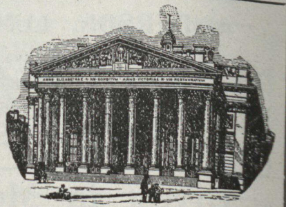
Head Office: Royal Exchange, London

Correspondence invited from responsible gentlemen in unrepresented districts re fire and casualty agencies.