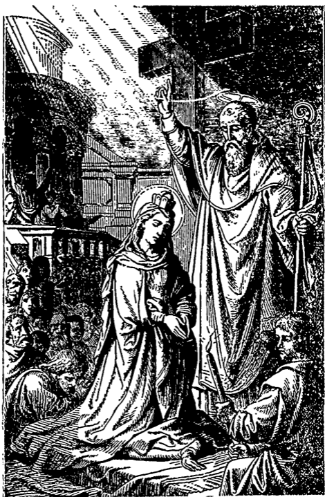
INVENTION OF THE HOLY CROSS

Macarius, the holy bishop of Jerusalem, not doubting but that God would discover which was the Cross they sought, caused