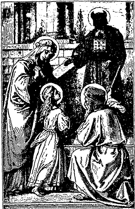
SAINT ANNE PRESENTS THE BLESSED VIRGIN In the Temple.