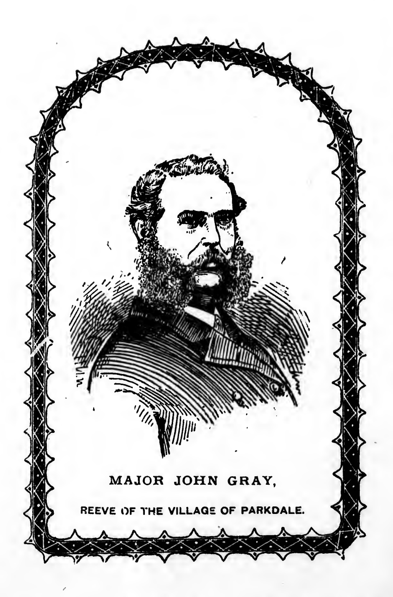
Engraved specially for the "Parkdale Register,"