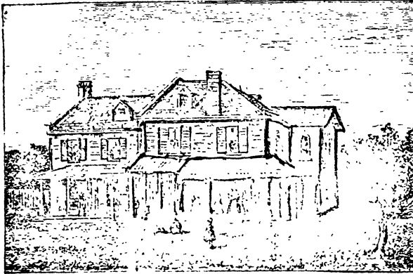
MARCHMONT HOME, BELLEVILLE, ONTARIO.