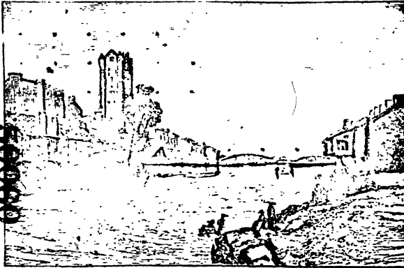
BELLEVILLE, ONTARIO. 1879.

WITH PREPARATORY NOTE BY HORATIUS BONAR, D.D., EDINBURGH.