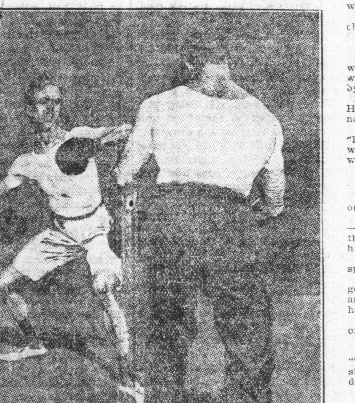
ALL'S WELLS THAT BEGINS WELLS! The Optimist (having his first lesson): "Of course, I expect to be pretty rotten without my glasses."