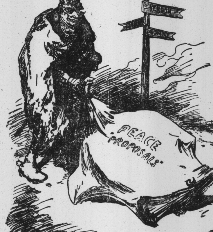
MAYBE SOMEBODY WANTS TO BUY A SUCKLING PIG, HEY?