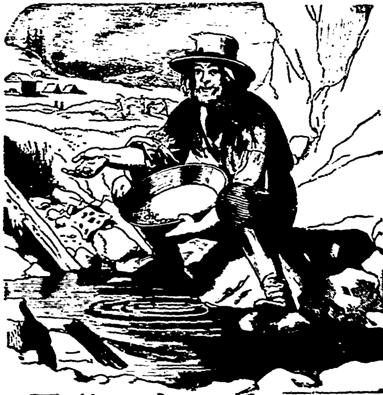
STRICK IT RICH.

water, and attains to 150 feet in height and from four to six feet in diameter. The head-like cotton pods are arranged on nodding or erect racemes, seeds white, capsules three to four valved. The timber is somewhat less white than the Aspen which is extensively used in the Eastern States for the manufacture of paper, and when thoroughly dry loses more than half its weight. All sorts of wooden vessels, clothespins, spools and similar turners' ware are made of it, but it has heretofore been regarded as one of our least valuable kinds of wood. However the despised Cottonwood may yet become the most popular as well as the most valuable tree. Late inventions and discoveries have revealed the fact that the finest polish and strongest household furniture can be made out of paper. It can be pressed so hard that no instrument short of a diamond can scratch it, and it can be given the finest shades in imitation of wood, and produced cheaper than walnut, mahogany or ebony. And late discoveries in paper making establish the fact that Cottonwood makes the whitest and strongest fiber pulp yet manufactured out of wood. There are