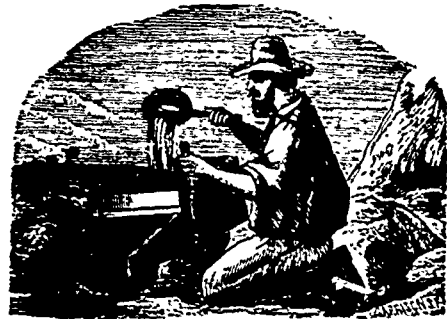
THE MODERN ROCKER.

four hundred miles of coast line in our western possessions, clothed with a forest growth superior to anything else in the world at present. Its shore indented with multitudes of harbors, bays and inlets, teeming with myriads of fish. Its rocks and sands containing gold, iron, silver, coal and various other minerals. And besides all this, a climate superior to England in every respect, both as regards heat and moisture, and yet men will ask what is it all worth? I answer, 'worth more than Quebec and all the maritime provinces thrown in, and sceptics may rest assured that the day is not far distant when my words will be accepted as truth.'— Prof. Macoun.