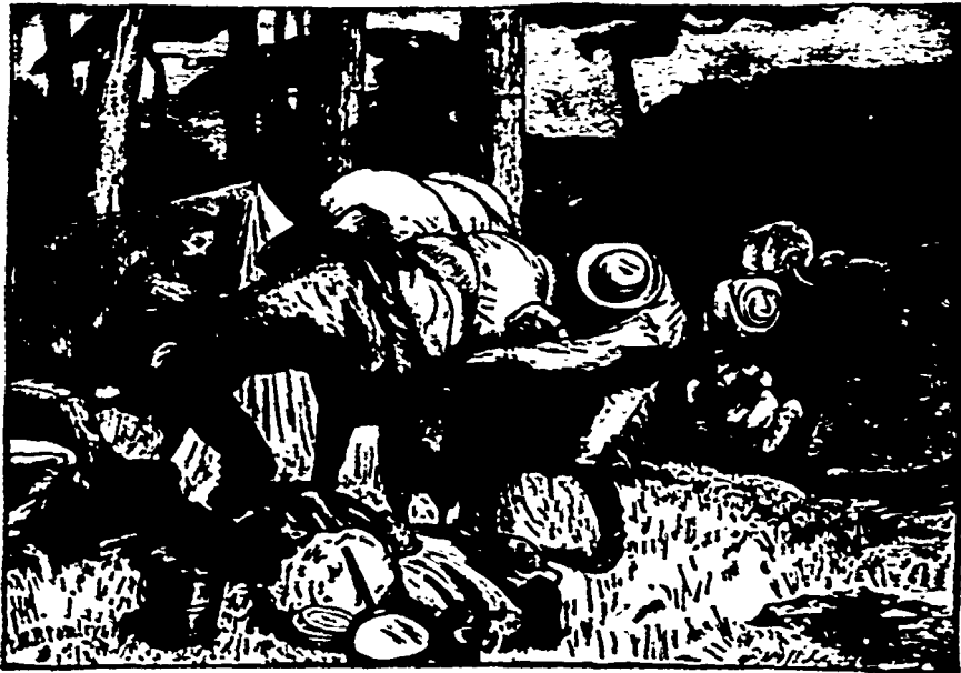
OFF ON A PROSPECTING TOUR.

Leaving our friends to settle their disputes with their long eared companions, and to complete their preparations for the journey, and wishing them bon voyage we will now, if the reader please, take a glance at the next page and note the scene there presented. Here they have arrived safe and sound, and again pitched their oft moved tents.